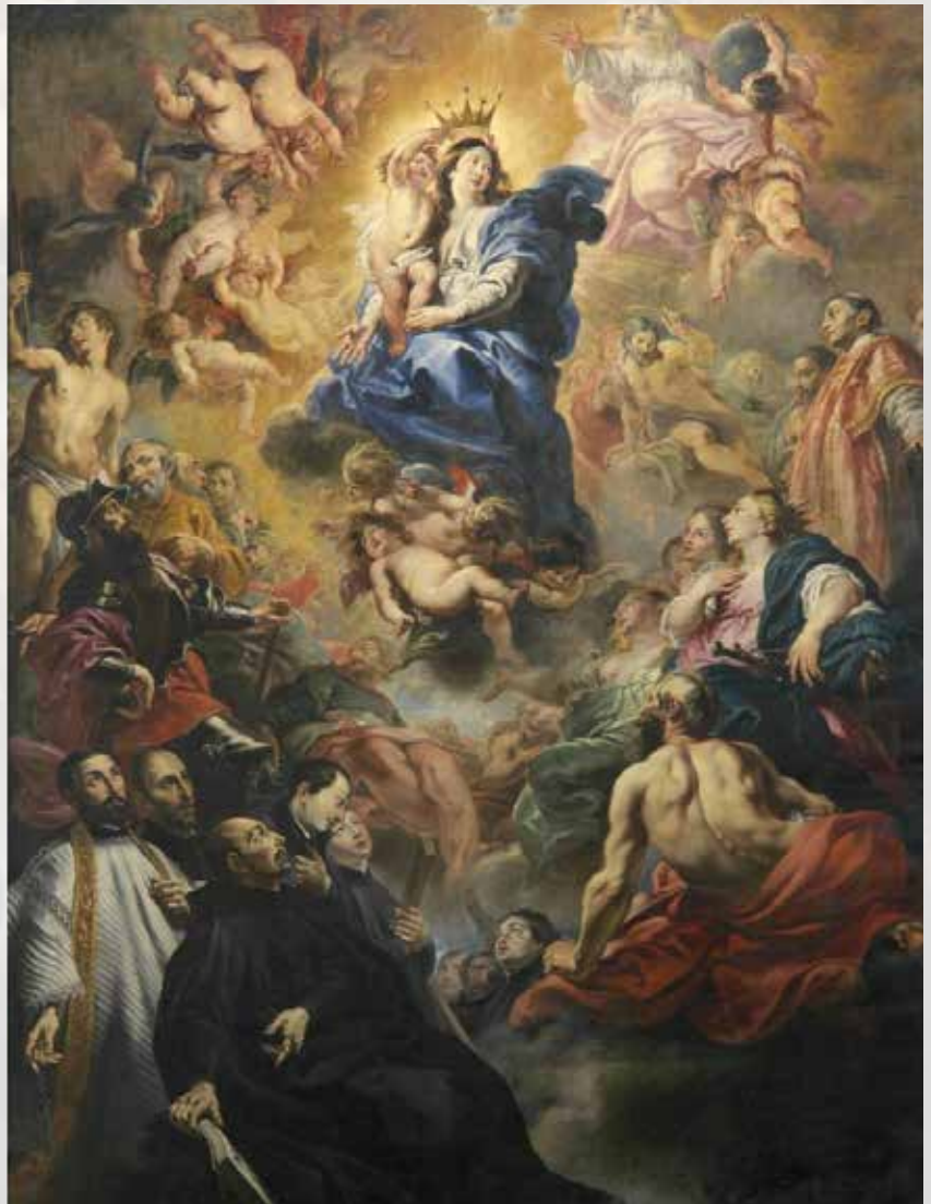
The Coronation of Mary Cornelis Schut (1597 - 1655)

During May Crowning, beautiful Marian hymns are sung and the service culminates in the crowning of a statue of Mary with a wreath of flowers. The beauty of this occasion makes it an evening not to be missed or soon forgotten. This devotion, which helps us show our love and gratitude to this most holy of women, is a perfect way to create sacred memories with family, friends, and parishioners. It is an opportunity to meditate on Mary’s goodness and great love of God. May we follow her example and live our own lives in God’s most holy will.