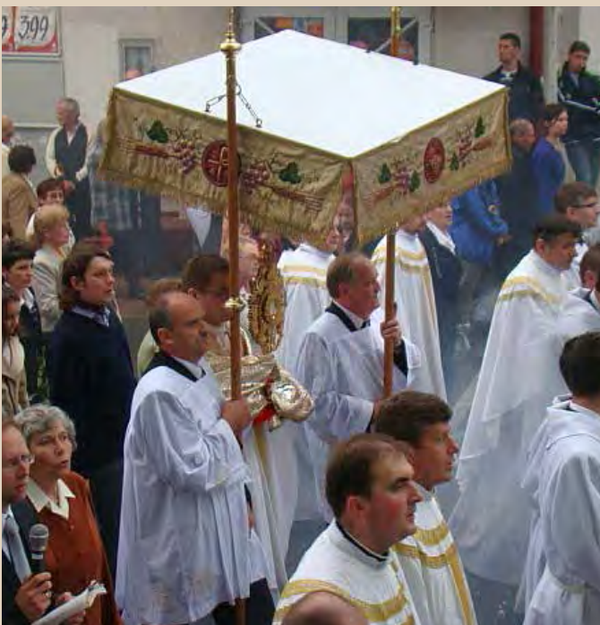
Procession in Sanok, Poland

At the end of the Noon Mass on Sunday, June 11, instead of a final blessing, the monstrance will be placed on the altar, and prepared for the Blessed Sacrament. Children in their First Holy Communion finery, together with their families, will lead the procession. Following them will be the choir, providing beautiful music, and representatives of our many parish ministries: from the Guild, day school and PSR teachers, lectors, Extraordinary Ministers of Holy Communion, Athletics, Youth Ministry and more! You